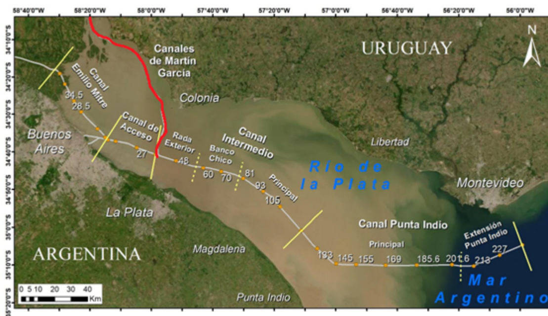
Figura 2.2 Canales del Río de la Plata.

(**) MAX PERMISSIBLE LOA FOR 'EMILIO MITRE CHANNEL' IS 230M. OTHER INDICATED DRAFTS ARE MAX PERMISSIBLE 'VALUES.