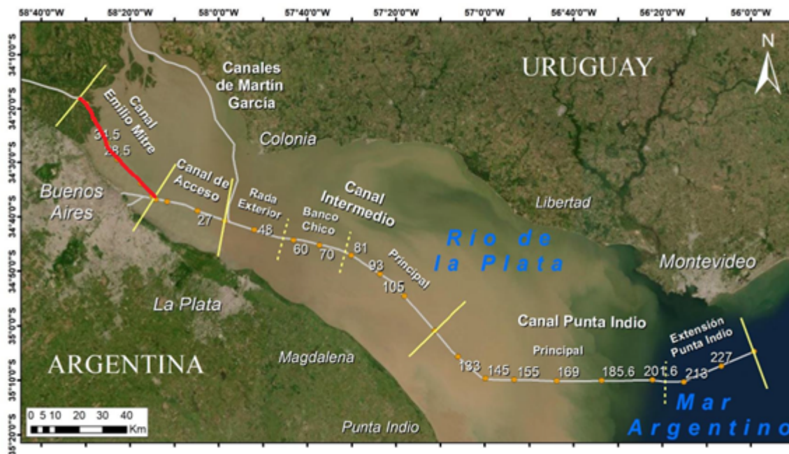
Figura 2.2 Canales del Río de la Plata.

III) Río Paraná de las Palmas: in the whole area under consideration, only the vessels whose maximum length does not exceed two hundred and thirty meters can navigate (230 m).