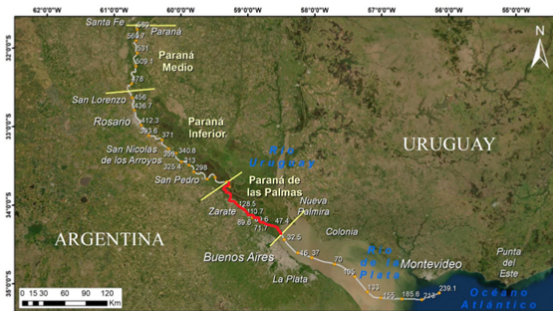
Figura 2.1 Sectores de la VNT.

III) Río Paraná de las Palmas: in the whole area under consideration, only the vessels whose maximum length does not exceed two hundred and thirty meters can navigate (230 m).